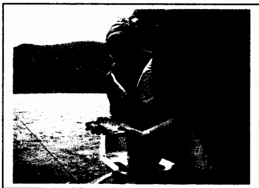
The boys catch fish on the Deerfield