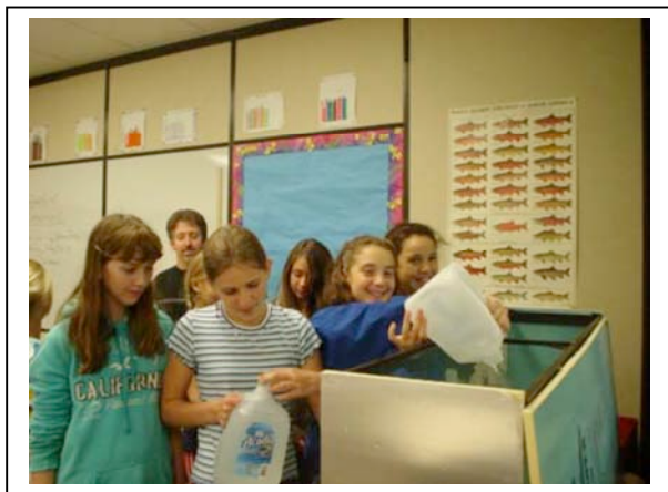
Kids enjoy starting the process