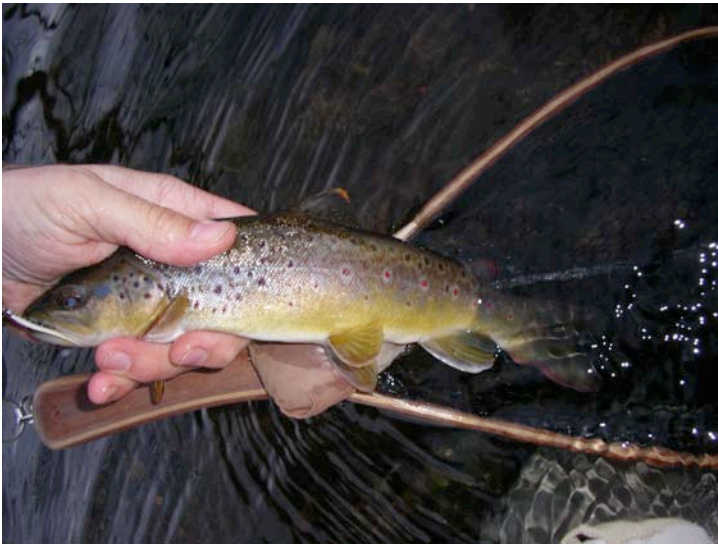
A Spawning Brown in one of our local streams

Our chapter meetings are held September through May on the second Tuesday of each month starting around 6:30 PM for snacks and coffee (and usually some fly tying) with the meeting starting at 7:30. The meetings are open to all – members and non-members. Come over and see what we're about, we'd like to meet you.