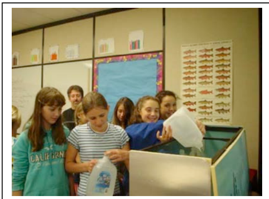
Kids enjoy starting the process

Don't forget to buy your tickets for the annual fundraiser banquet on March 14, and if you can, make a donation for one of the auctions.