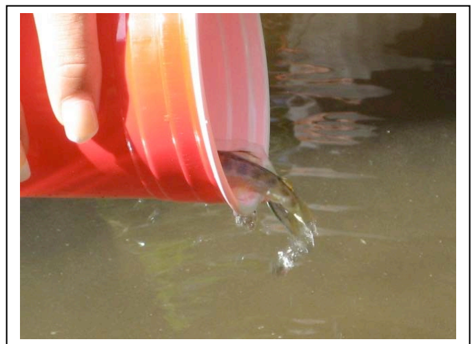
Trout enjoys release (end) part of the process