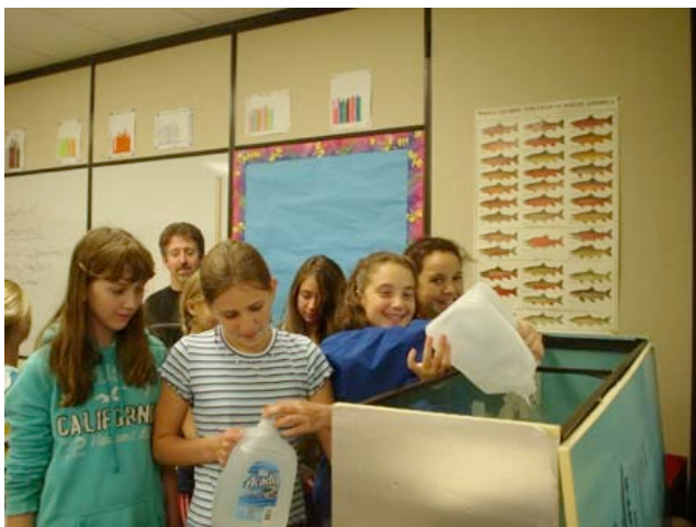
Kids enjoy starting the process

If you have any questions or an interest in the program, call me at 775-2764. I really need someone with some New Milford academic roots! Don't forget to bring an inactive member to the meeting in December.