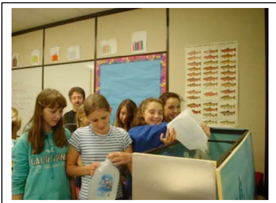
Kids enjoy starting the process

If you have any questions or an interest in the program, call me at 775-2764. I really need someone with some New Milford academic roots! Don't forget to bring an inactive member to the meeting in December.