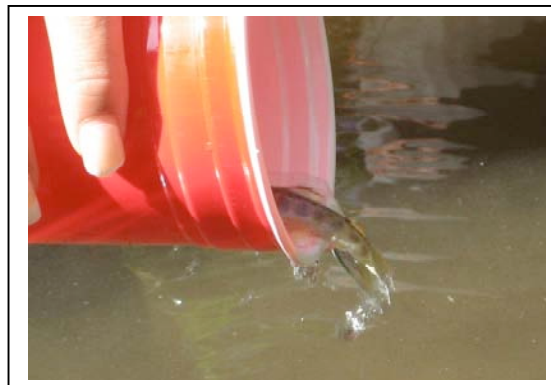
Trout enjoys release (end) part of the process