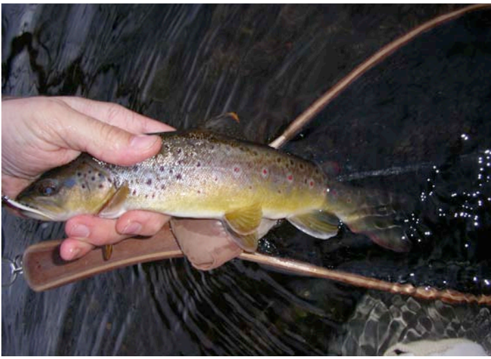
A Spawning Brown in one of our local streams

Our chapter meetings are held September through May on the second Tuesday of each month starting around 6:30 PM for snacks and coffee (and usually some fly tying) with the meeting starting at 7:30. The meetings are open to all – members and non-members. Come over and see what we're about, we'd like to meet you.