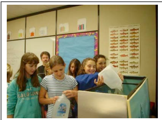
Kids enjoy starting the process

If you would like to join me or one of the mentors on a release, contact me by phone or e-mail and I will try to make the arrangements. Again, thank you, mentors, for all your help.